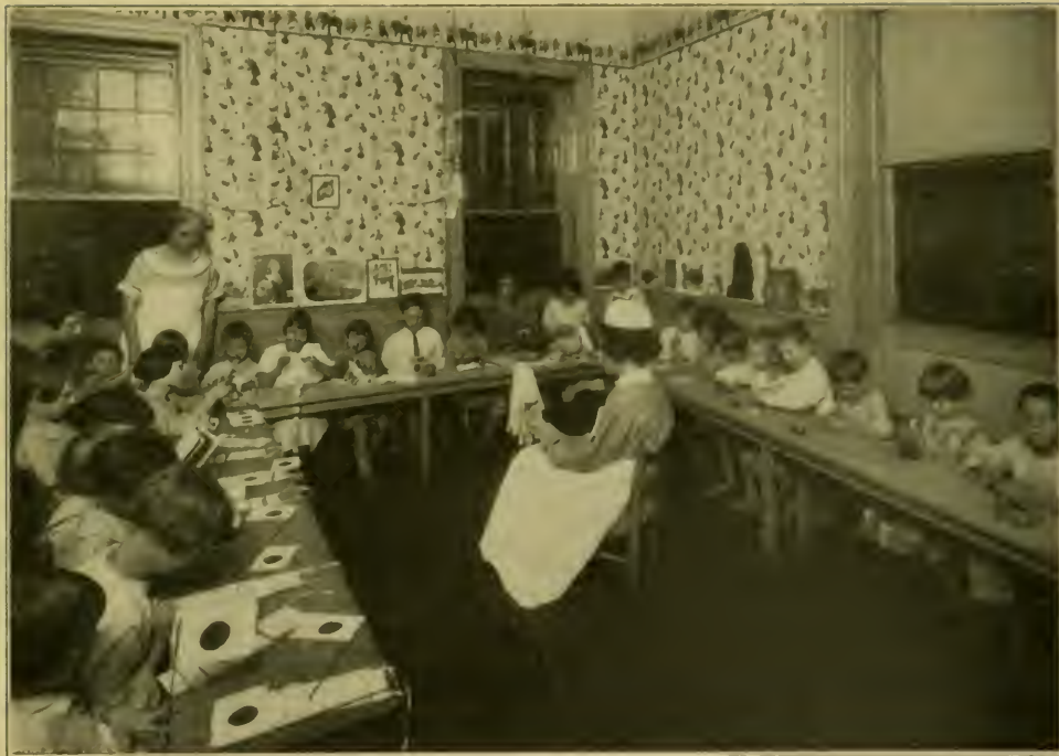
A Kindergarten at Work